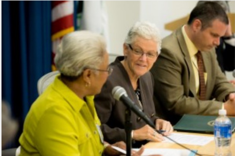
— EPA Administrator Gina McCarthy listens to