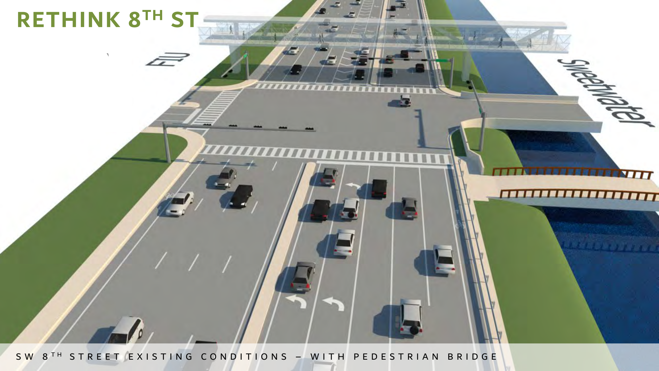
SW 8 TH STREET EXISTING CONDITIONS - WITH PEDESTRIAN BRIDGE