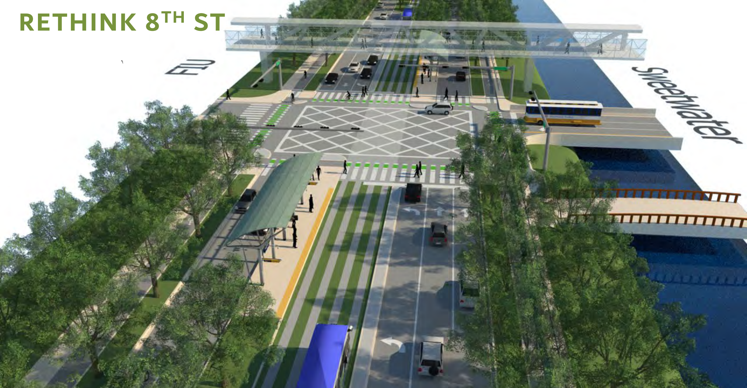
SW 8 TH STREET PROPOSED REDESIGN - PLUS STREET TREES