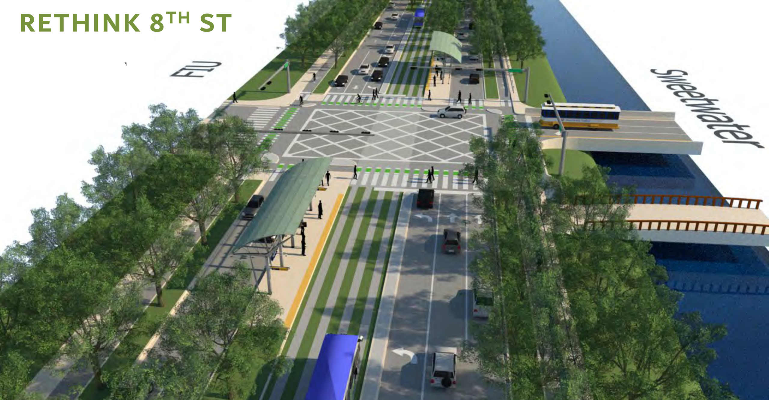
SW 8 TH STREET PROPOSED REDESIGN – WITHOUT A PEDESTRIAN BRIDGE