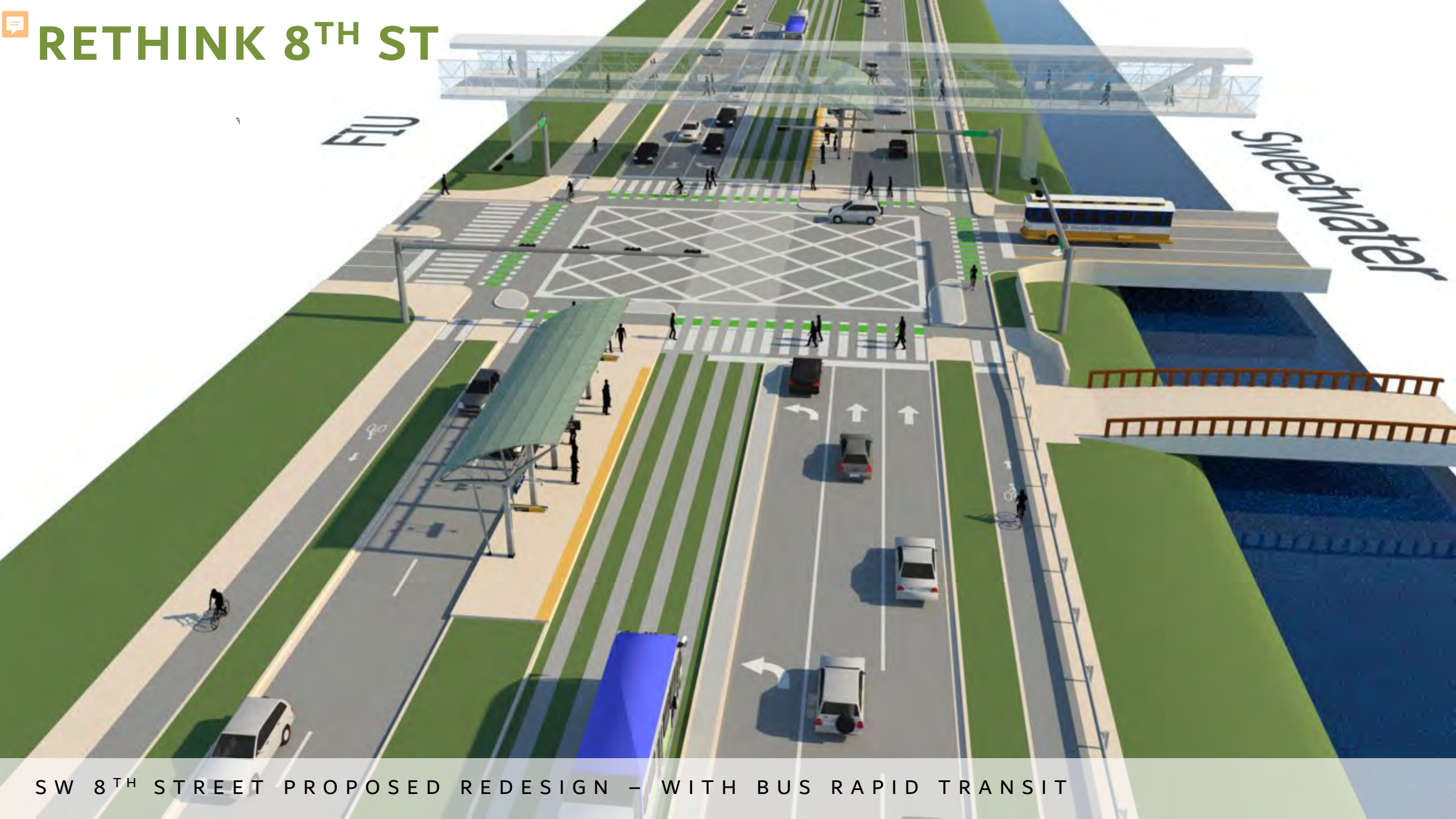
SW 8 TH STREET PROPOSED REDESIGN - WITH BUS RAPID TRANSIT