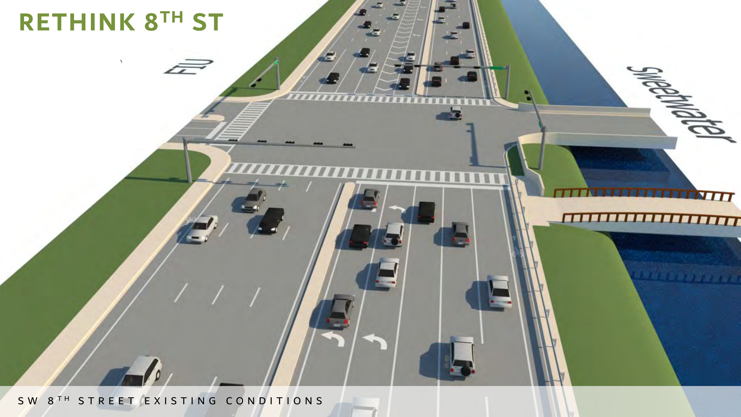
SW 8 TH STREET EXISTING CONDITIONS